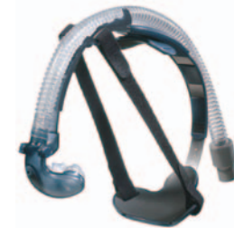
Breeze SleepGear With DreamSeal Assembly